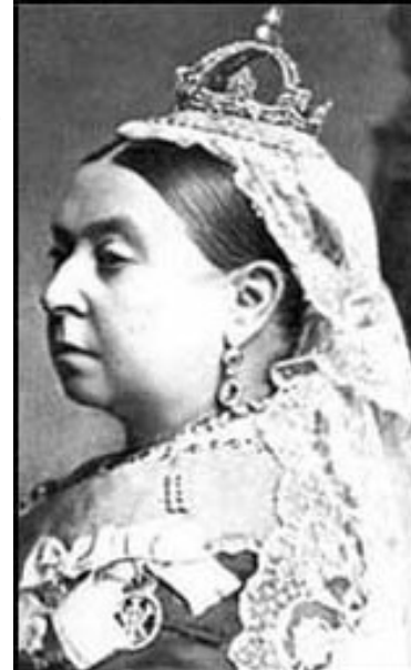
By our Royal Correspondent

Finally, she returned to the town centre via the historic Ballantine Creative Ironworks , which has put the name of Bo'ness into towns and cities across the world, marvelling at the views across the River Forth and the foreshore footpaths enjoyed by so many in our town.